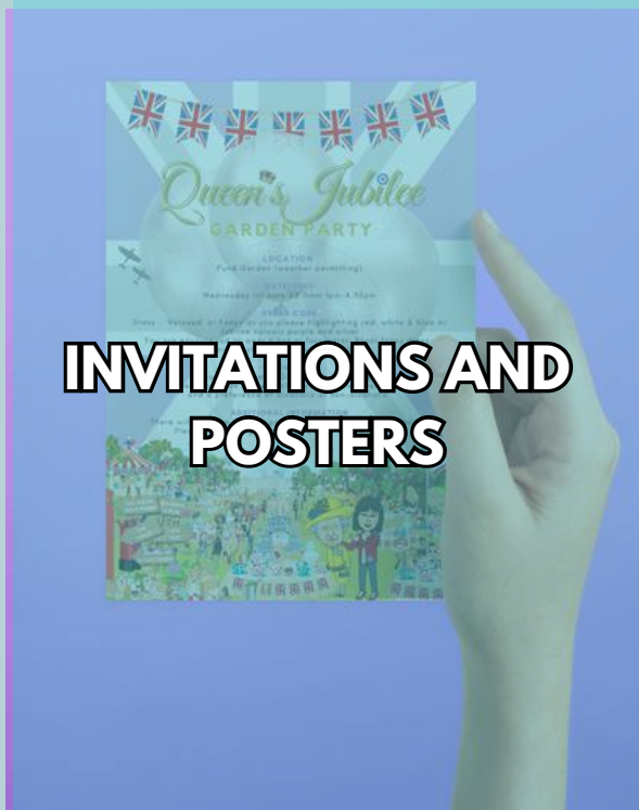
INVITATIONS AND POSTERS