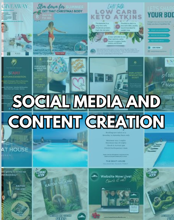
SOCIAL MEDIA AND CONTENT CREATION