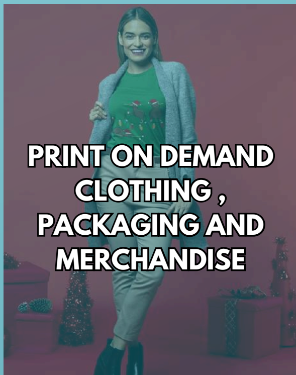
PRINT ON DEMAND CLOTHING, PACKAGING AND MERCHANDISE