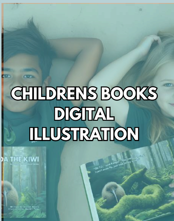
CHILDRENS BOOKS DIGITAL ILLUSTRATION