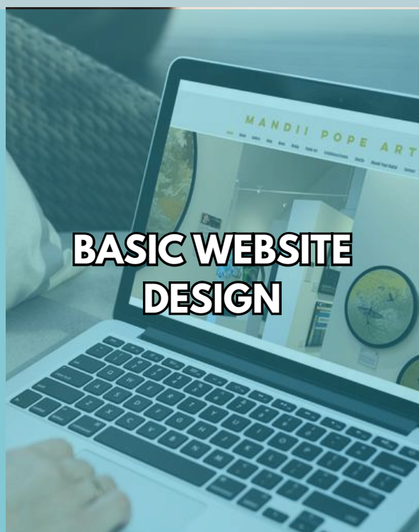
BASIC WEBSITE DESIGN