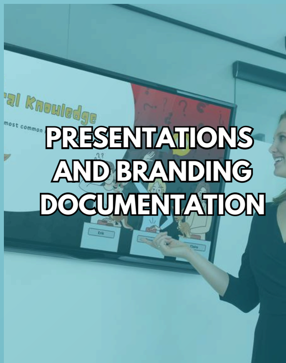
PRESENTATIONS AND BRANDING DOCUMENTATION