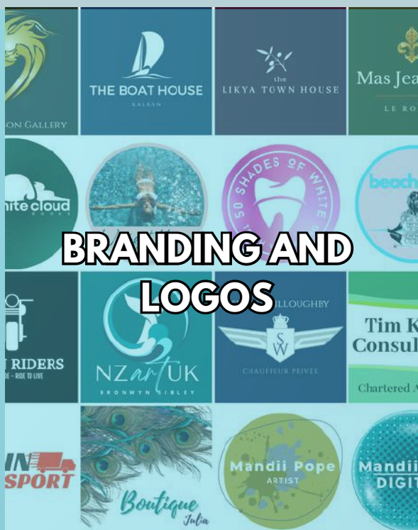
BRANDING AND LOGOS